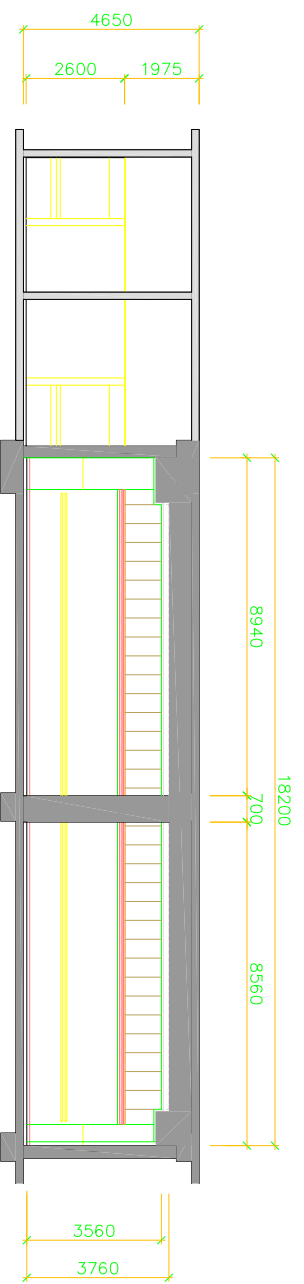
B SECTION SCALE : 1/200